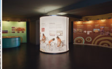
S'illot Visitor Center