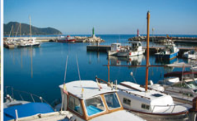
Cala Bona Port